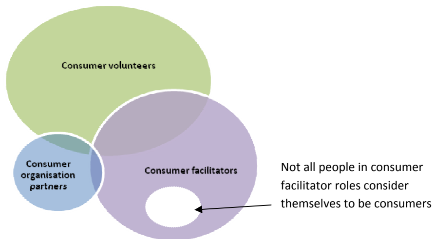
FIGURE 1: Model of consumer groups participating in the Collaboration

Three fundamental groups or types of consumers can be described as participating in the Collaboration. These overlap as most people rarely all fit into one type (see Figure 1).