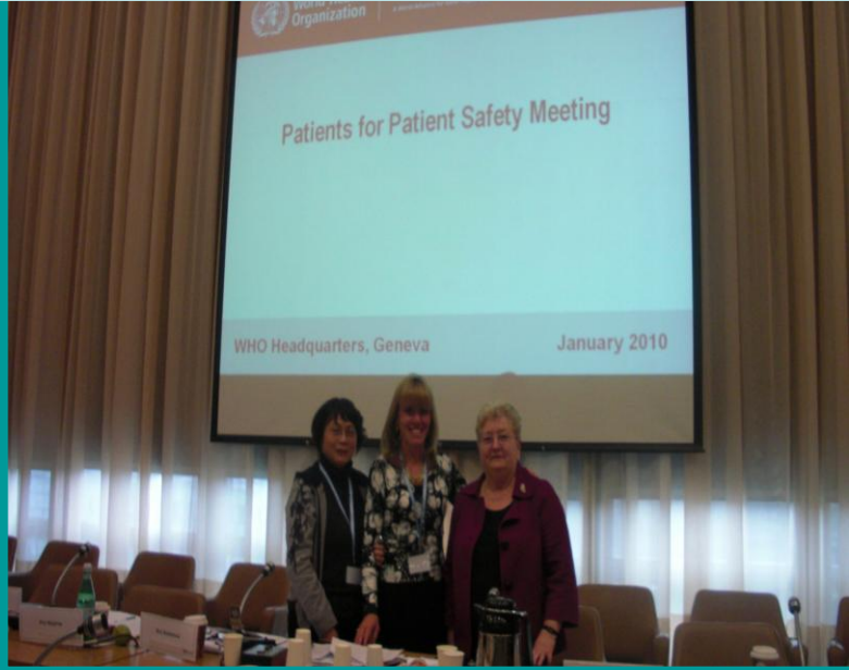
Patient safety lessons for clinicians. Chengdu Hospital